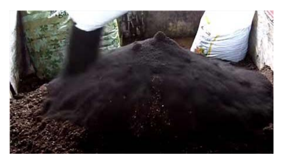
9.) Add 1 bag of Roots Organic soil (you should have 1 bag left)1 bag Roots Organic Soil