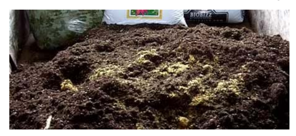
5.) Sprinkle Dolomite Lime over entire pileSprinkle Dolomite Lime