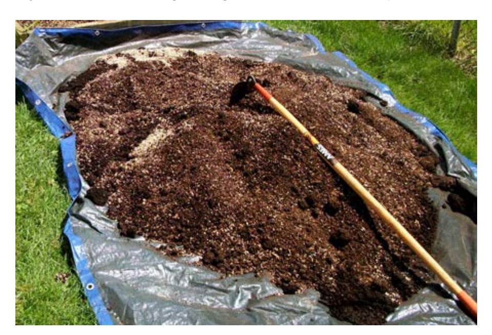
Add 4 bags of Roots Organic Soil to bottom of container