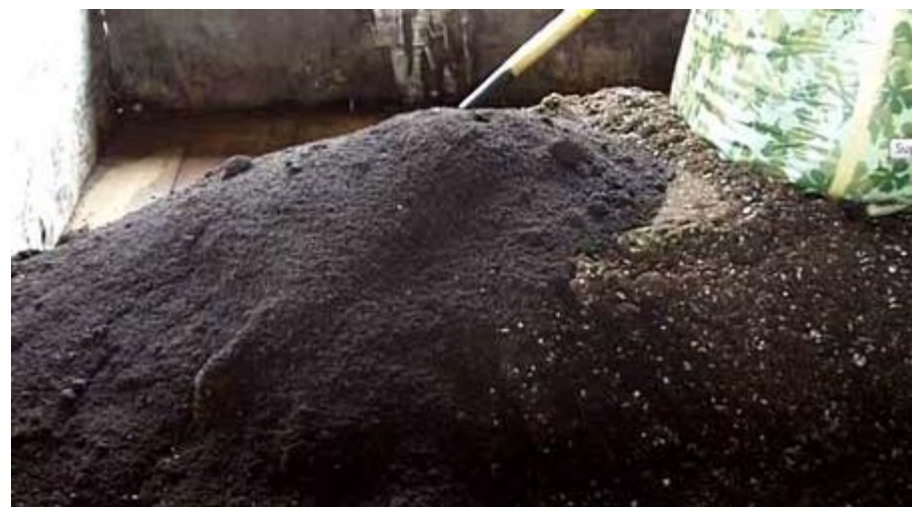
13.) Add last bag of Roots Organic SoilLast bag Roots Organic Soil