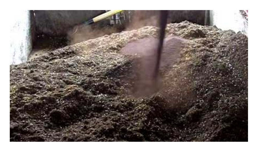
16.) Add Bat Guano