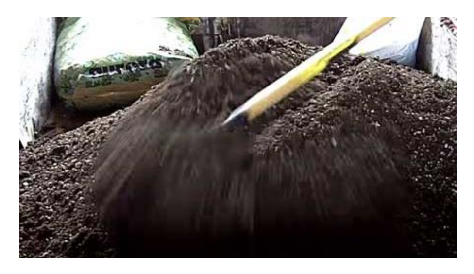
11.) If you're using perlite, add it now.