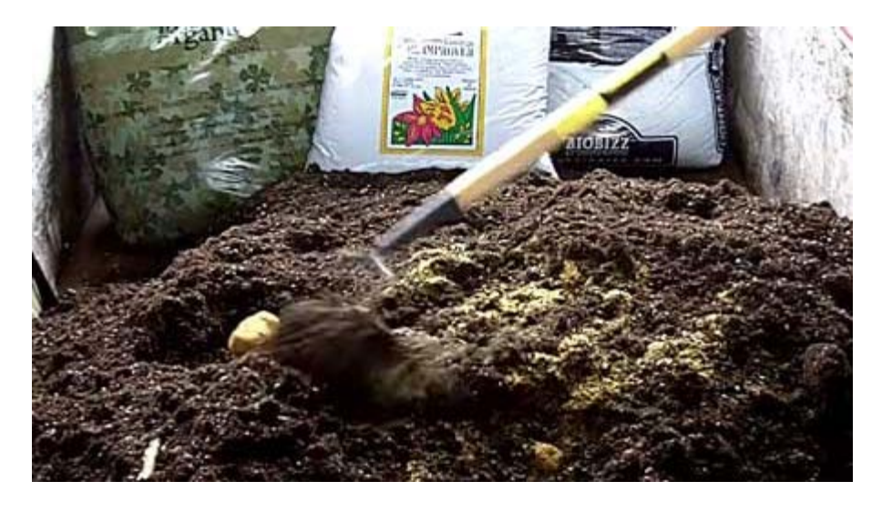
Here is what the Fish Bone Meal and soil looks like after a light mixing: