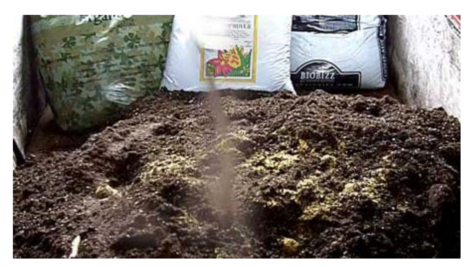
6.) Sprinkle Granular Azomite over entire pile