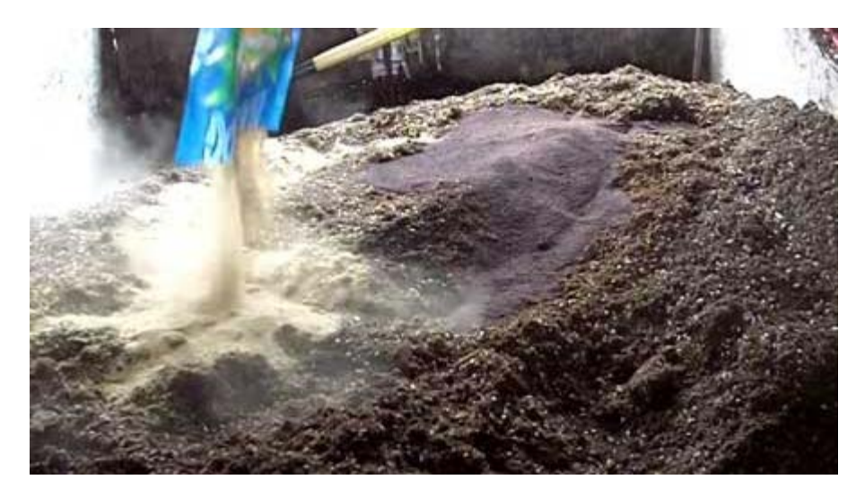
17.) Add Epsom Salt