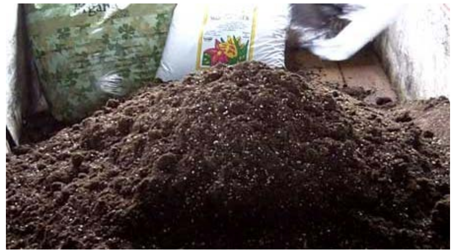
8.) Add 1st bag of worm castings1st bag Earthworm Castings