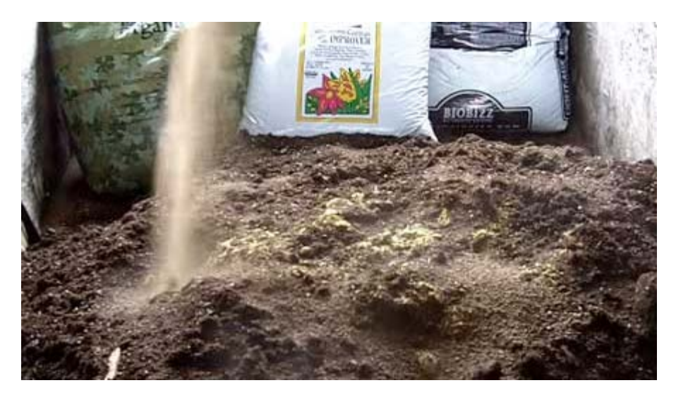
7.) Add the last bag of Biobizz Light-Mix2nd bag Biobizz Light-Mix soil