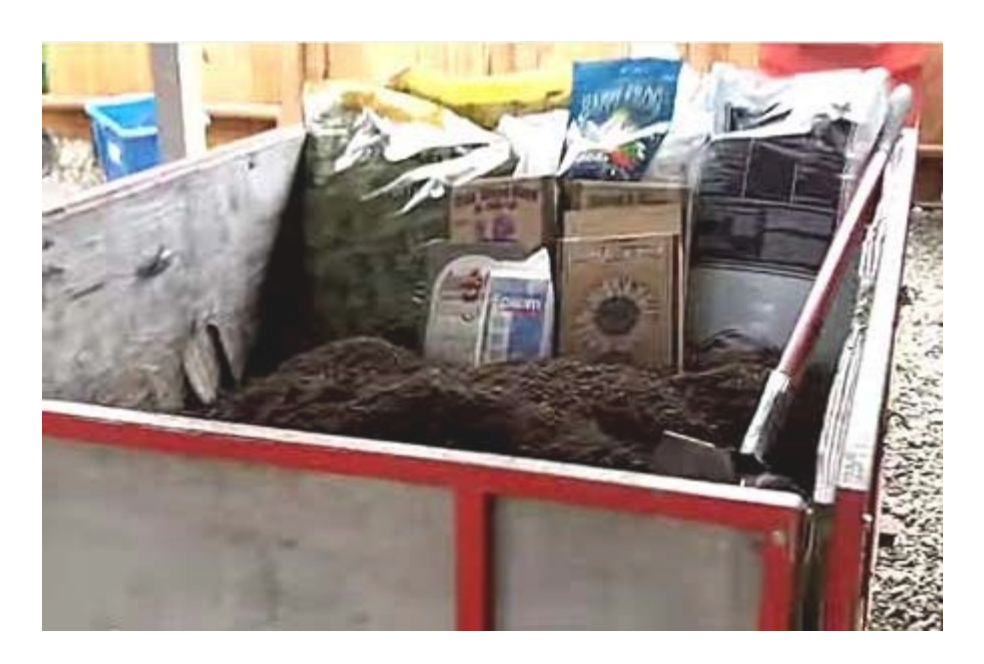
If you don't have a big enough container, use a tarp or even a kiddie pool