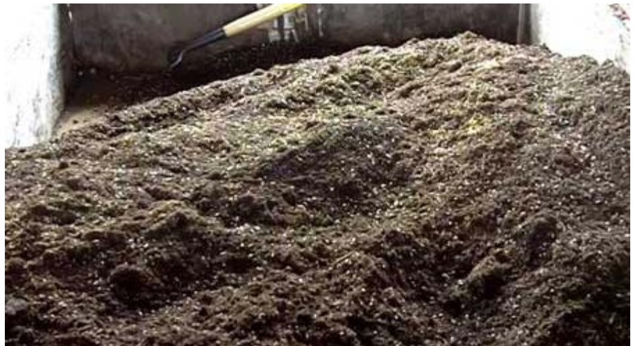
15.) Add Blood Meal Blood Meal