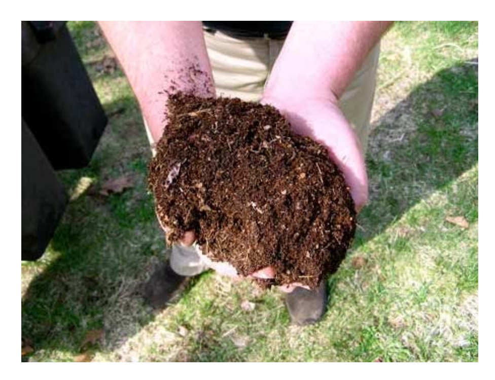
Learn more about soil vs other growing mediums

Growing cannabis with organic composted super soil is a completely different experience compared to most other forms of growing cannabis. Instead of using unnatural chemical salts created in a lab to provide your plants with nutrients, you are re-creating an optimal version of how cannabis grows in the wild.