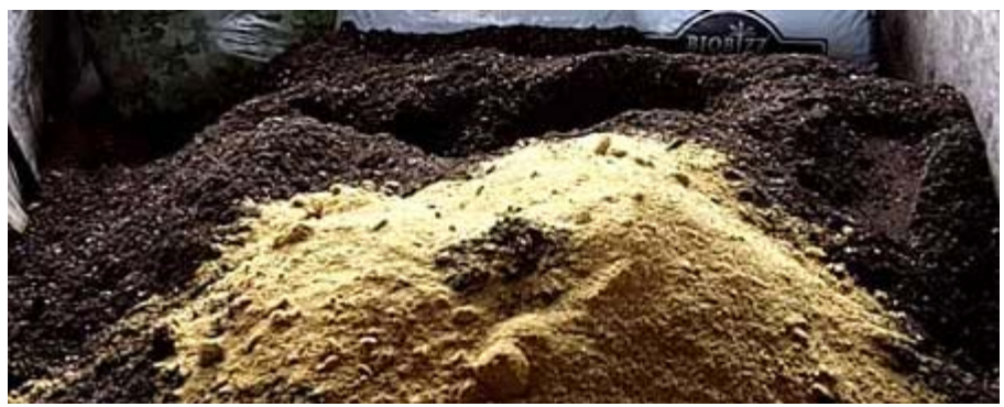
3.) Add 1 bag of Biobizz Light-Mix (there should be 1 bag left)1st bag Biobizz Light-Mix soil